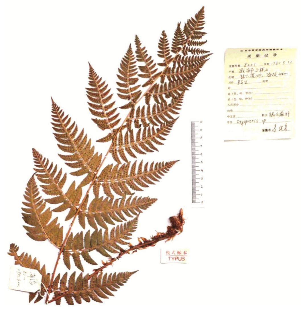
Fig. 1. A branch of Dryopteris lijianxiuii X. J. Li

Type specimen : China, Shandong Province, Weihai City, Zhengqishan Mountain, wet habitat, 37°33'34.73"N, 122°19'10.36"E, 370 - 500 m a. s. l., 22 August 1982, J. X. Li 822-1 (Holotype: PE, Isotype: SDCM). Fig. 1.