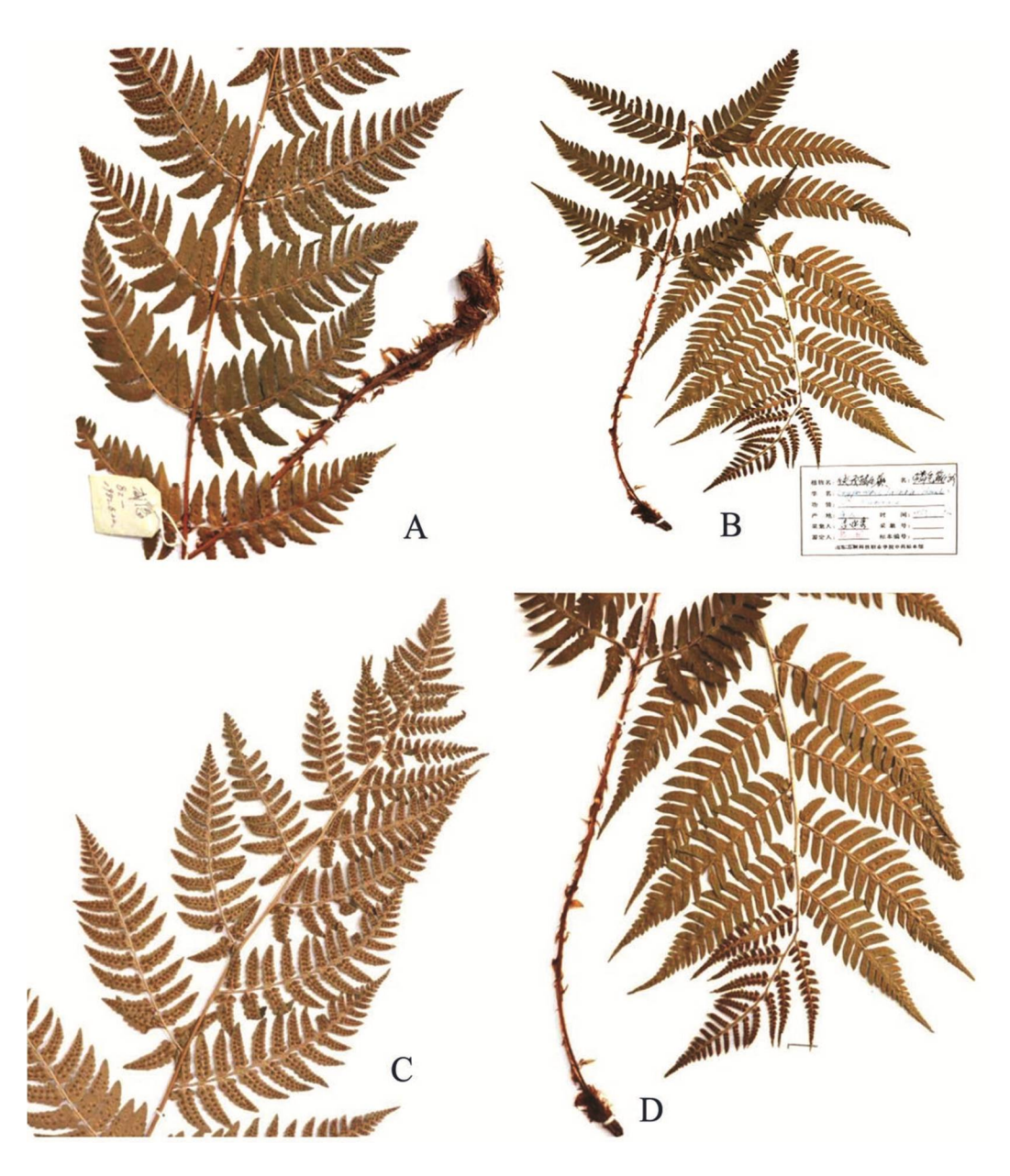
Fig. 2. The leaves of D. lijianxiuii sp. nov. and D. lacera . A. The sori of D. lijianxiuii were distributed in the upper or middle part of 1-3 pairs of pinnaes at the base of the leaf. B. The leaf of D. lacera . C. The sori of D. lijianxiuii densely covered with the upper and middle pinnaes back. D. The sori of D. lacera were only born on the back of the constricted part of the top of the leaf.

The study of the spore morphology and sporoderm pattern of pteridophytes by Zhang (1979), Zhang and Xi (1976), Zhang et al. (2012) is of great significance to the taxonomy of pteridophytes, not only as an important basis for finding their position in plant taxa, but also as an important